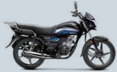
Black with Blue