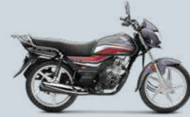
Geny Grey Metallic