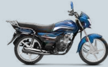
Athletic Blue Metallic