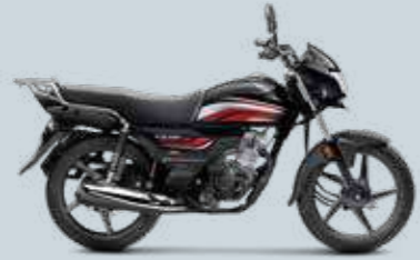
Black with Red