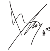
Marc Marquez MotoGP Champion